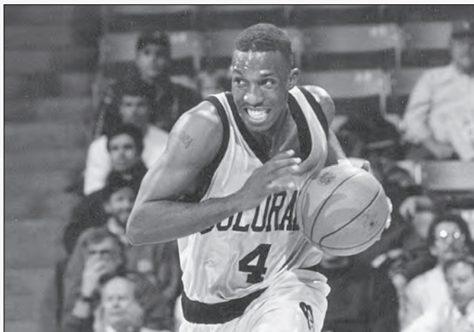
On Dec. 2, 1995, Chauncey Billups became the first Buff player to record a triple-double (points, assists, rebounds).